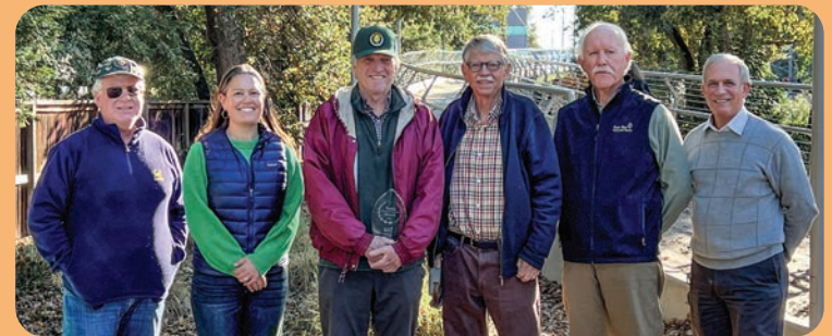
Rep. DeSaulnier with Park District officials

The East Bay Regional Park District and the Regional Parks Foundation have named U.S. Representative Mark DeSaulnier the 2023 Radke Championing Advocacy Award winner. Congressman DeSaulnier has been a long-time supporter and avid user of Park District parks and trails. In 2022, he was instrumental in securing $3 million in federal funding for the District's planned visitor center at Thurgood Marshall Regional Park – Home of the Port Chicago 50.