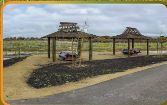
Coyote Hills Restoration and Public Access Projects Coming Soon.....See page 2

Enjoy Upcoming 90 th Anniversary Events See page 3